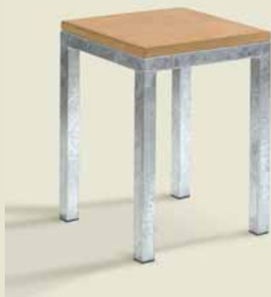
Side table L 41 cm, W 41 cm, H 50 cm, 18 kg BT40