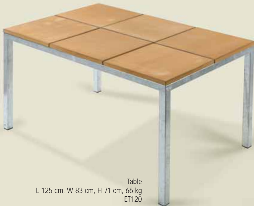
Table L 125 cm, W 83 cm, H 71 cm, 66 kg ET120