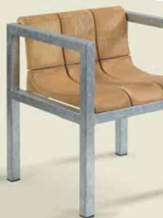
Armchair with ceramic backrest L 61 cm, D 57 cm, H 71 cm, seat height 45 cm, seat depth 49 cm, 36 kg SMKL