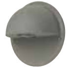
DE-GR, opal grey

Ø 30 cm · D 16 cm · 5,1 kg · safety class I · IP 65 · 230 V · max. 50 W