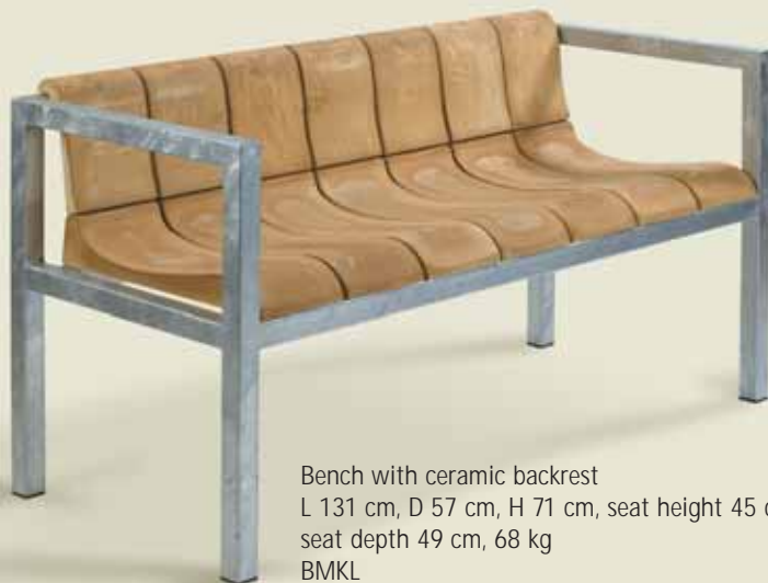
Bench with ceramic backrest L 131 cm, D 57 cm, H 71 cm, seat height 45 cm, seat depth 49 cm, 68 kg BMKL