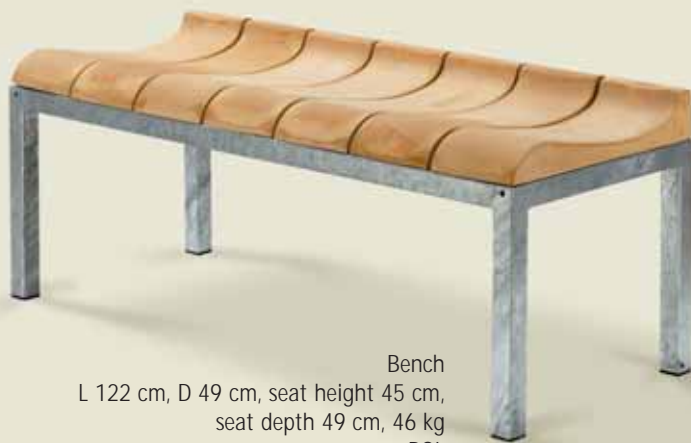
Bench L 122 cm, D 49 cm, seat height 45 cm, seat depth 49 cm, 46 kg BOL