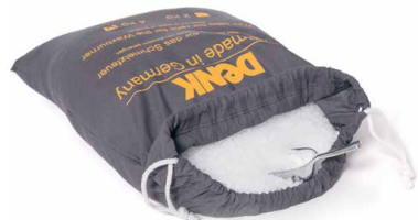
Wachs for Refill SFP2 2kg | SFP4 4kg