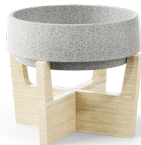
Wooden Stand Stackable for Dog Bowl M & L

Art.-No. HST | L 24,4 cm | B 24,4 cm | H 14 cm | 360 g