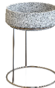
Stainless steel stand

Art.-No. HST | L 24,4 cm | B 24,4 cm | H 14 cm | 360 g