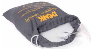
Wax pastilles refill SFP2 2 kg SFP4 4 kg